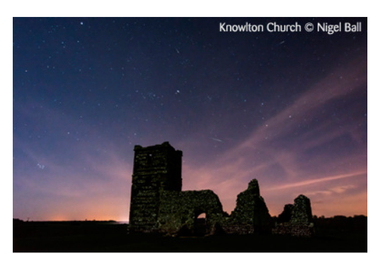
Knowlton, Wimborne, Dorset BH21 5AE

Many people report a strange sensation when standing at the centre of Church Henge, among the ruins of the medieval church. This is perhaps because it is at the heart of a major pagan ceremonial site, once taken over by Christian worship, but now returned to nature. Surrounding the site is the largest concentration of pre-historic barrows and henges found anywhere in the UK. Read up on the constellation myths created by our ancestors that tell of gods and monsters, heroes and villains and other legends using only the stars in the night sky and then witness the incredible theatrical display for yourself. The backdrop of the stunning church also makes for fantastic astrophotography.