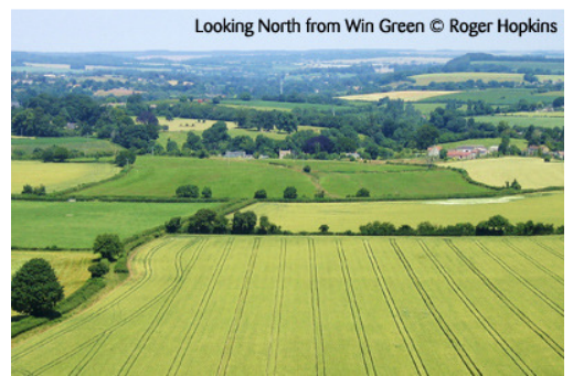
Donhead Hollow, Near Ludwell, Wiltshire SP7 0ES

One of the best known and most iconic sites in the Cranborne Chase AONB, Win Green is its highest point as well as a Site of Special Scientific Interest. It contains chalk grassland, a habitat that has been seriously eroded in the UK and offers extensive views, with Bournemouth, the Isle of Wight, Salisbury, Glastonbury Tor, the Mendips, the Quantocks and Milk Hill all visible when clear.