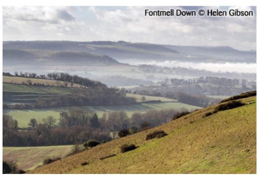
Spreadeagle Hill, Melbury Abbas, Dorset SP7 0DT

At 263m, the summit of Melbury Hill is one of the highest points in Dorset. An Armada beacon sited here in 1588 formed part of the chain of signal beacons stretching between London and Plymouth. What better place to witness the other navigational tools used by sea farers worldwide – the mystical constellations. This site offers superb panoramic views which, apart from Win Green, are unparalleled in the AONB.