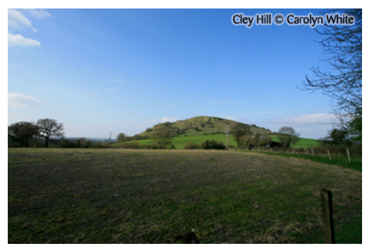
Corsley, Warminster, Wiltshire BA12 7QU

Although a bracing walk to the top of this ancient hillfort, once you've reached the summit you'll be on top of one of the UK's UFO hotspots. For almost 40 years this site has drawn UFO spotters who are keen to see if the talk of lights, flying objects and other unidentifiable oddities are true. Warminster has a designated National Reporting Centre for UFOs - so you won't have to go far to record your sightings. The site offers 360 degree views of the surrounding hills and while the lights of Warminster may reduce the quality of the darkness, you may well enjoy an out of this world experience.