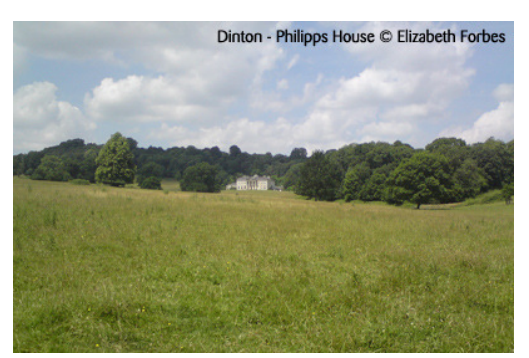
St Mary's Road, Dinton, Wiltshire SP3 5HH

Perfectly described by the National Trust as "far-reaching rolling parkland with tranquil views in the grounds of a Neo-Grecian house". Please note that car parking for Dinton Park is located on St Mary's Road immediately south of St Mary's Church. There is no visitor car parking at Philipps House itself. This park is one of Wiltshire's best kept secrets and boasts substantial views - even Salisbury Cathedral can be seen from the highest point. Just like the