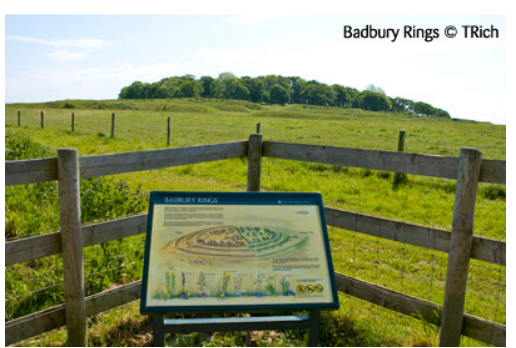
B3082, near Wimborne, Dorset BH21 4DZ

Badbury Rings is an Iron Age hill fort in the territory of the Durotriges. In the Roman era, soldiers built a temple nearby which was used by the people of Vindocladia, a small local settlement. Back then there was little light pollution and our ancestors would have visited Badbury Rings and witnessed the full majestic view of our galaxy and beyond.